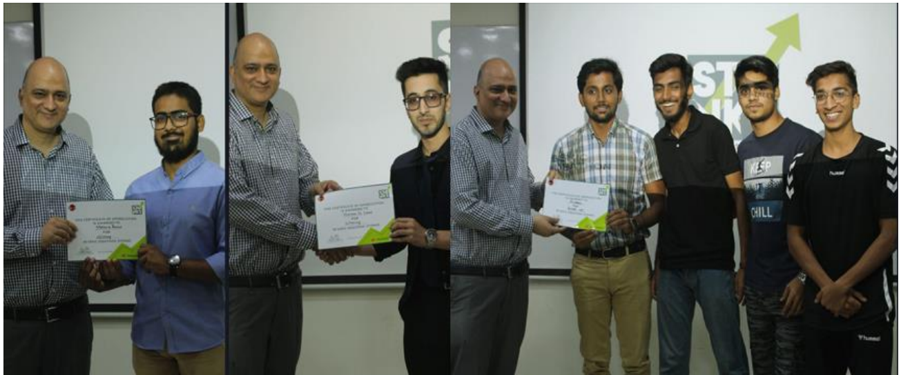
WINNERS TEAM MARKETING MAVERICKS