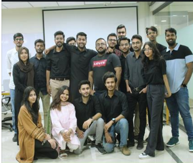
MANAGEMENT TEAM SSKIC IDEATHON - STONKS