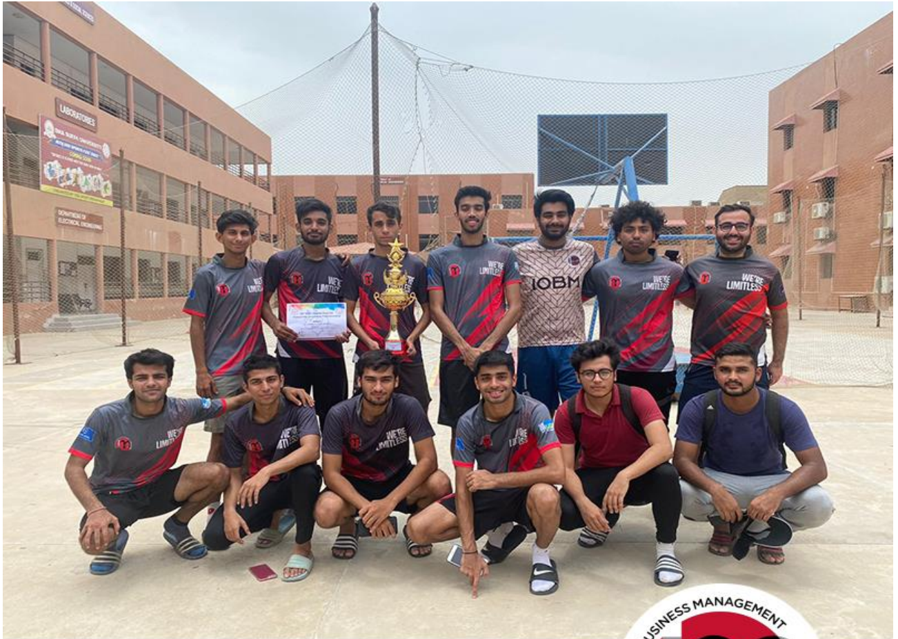
IoBM Team Red crowned Champions of DHA Suffa University Futsal Tournament 2023